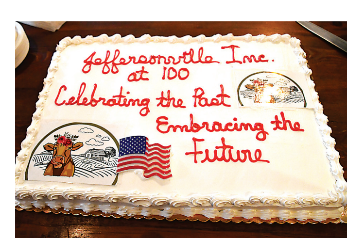
Village residents even enjoyed a birthday cake.

Dworetsky Holiday Parade Place: Main Street Jeffersonville Time: 7:00 PM Don't forget to visit the Backyard Park for the spectacularly decorated Holiday Tree display.