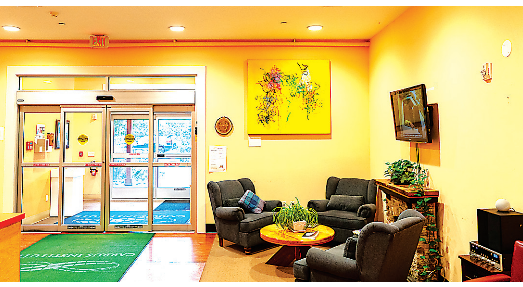
The Center for Discovery has been gifted five original works by renowned abstract expressionist painter Cleve Gray, each ranging in value from $30,000 – $50,000.